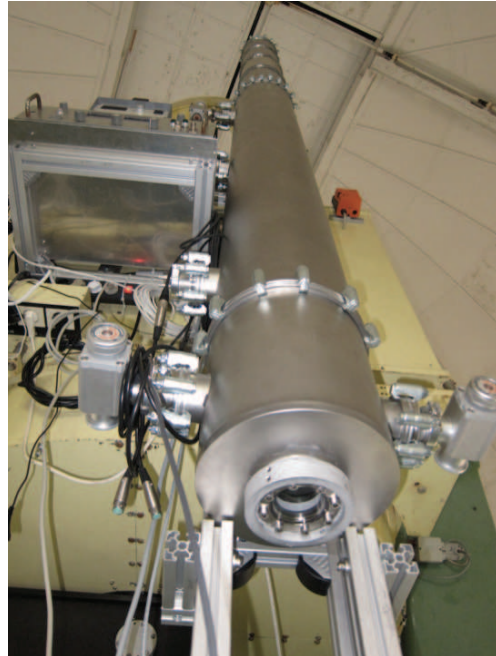
Figure 1: The helioscope TSHIPS attached to the equatorial mount of the Oskar Lühning Telescope at the Hamburger Sternwarte.

The current Telescope for Solar Hidden Photon Search TSHIPS consists of a 430 cm long stainless steel tube with a diameter of 25 cm combined from the tubes of two prototype vacuum vessels and a detector compartment (see Fig. 1). The upper tube is a lightweight vault structure developed for this project. TSHIPS is mounted on the Oskar Lühning Telescope (OLT) located at the Hamburger Sternwarte in Hamburg-Bergedorf and can thus be remotely controlled. It